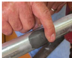
fill cracks, holes and mold