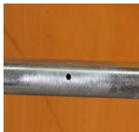
Clean and prep. Area

Mfd. in U.S.A. for ESPEX INTERNATIONAL LLC, P.O. BOX 210817, ROYAL PALM BEACH, FLORIDA 33421